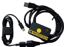
141083000 USB HID DATA TRANSFER CABLE 2.5M DIRECT DATA TRANSFER, LIKE A KEYBOARD